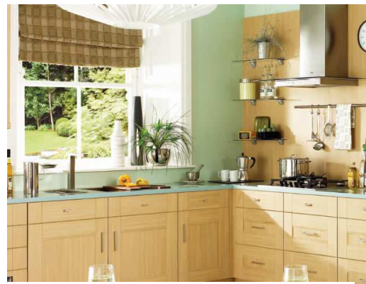
Eco Kitchen's And Bedrooms www.planitkitchens.co.uk/eco_kitchens.html

Look for fine furniture with earth-friendly upholstery at www.furniturebylee.com Need art? Crave objects d'art for your new home? Visit students and alumni at Emily Carr University of Art and Design to peruse or buy, www.ecustudioshop.ca