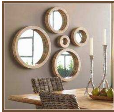
Porthole Mirror Collection GOGREENLIFE.com

The Spring Home Expo & Leisure Show begins March 6 th at 2pm, Cypress Centre National Women In Business Expo happens March 29 th at Stampede Park, Calgary